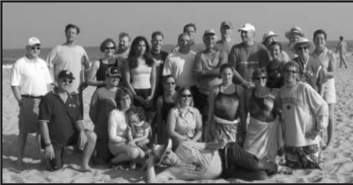
THE MASTERS SWIMMERS PRESENT STRIKE A POSE.