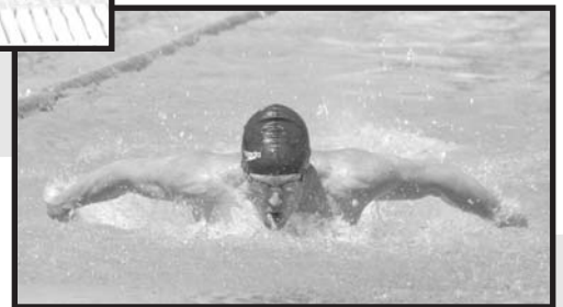
BELOW: STEVE HILTABIDDLE, WORLD CHAMP IN THE 50 FLY!