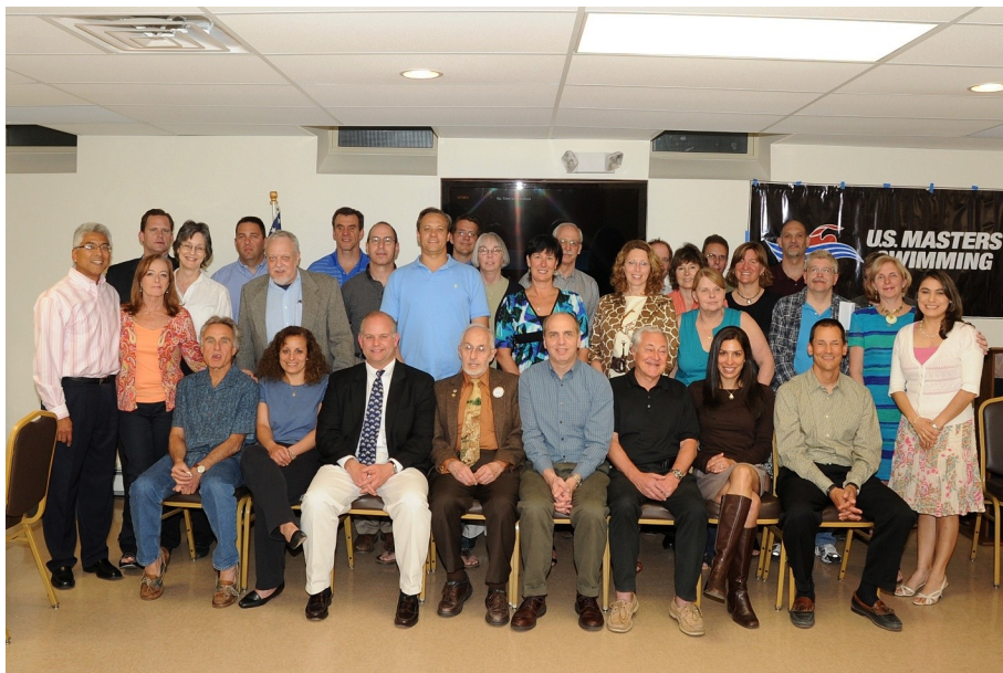
Attendees from the 2010 Annual Awards Banquet held on Saturday May 8