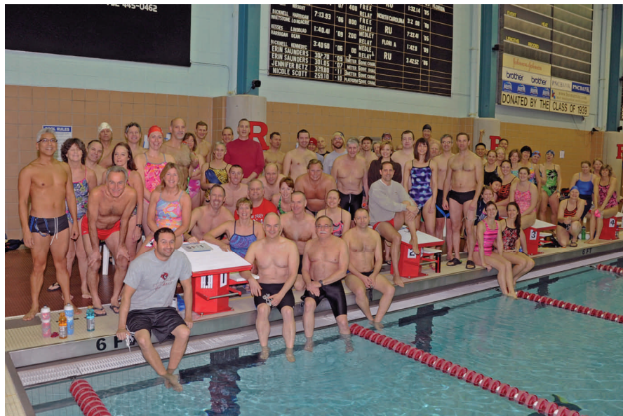
Swimmers strike a pose before the full-to-capacity 100 X 100's began on February 5 at Rutgers University