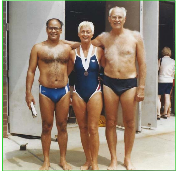
Three Jersey Masters swimmers winners of the Ocean County Pentathlon event — Garden State Games circa 1980!