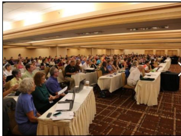
The House of Delegates busy at work in Jacksonville.